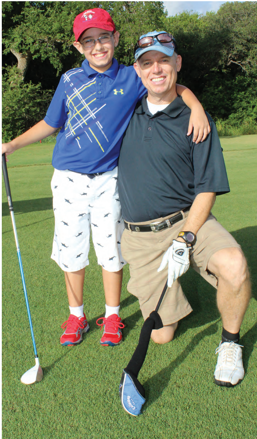
The 9th Annual Fisher House Golf Tournament.